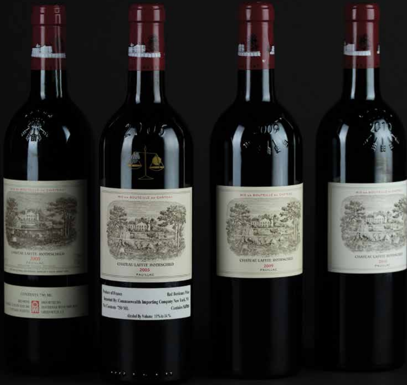
Lots 505, 509, 513 & 514