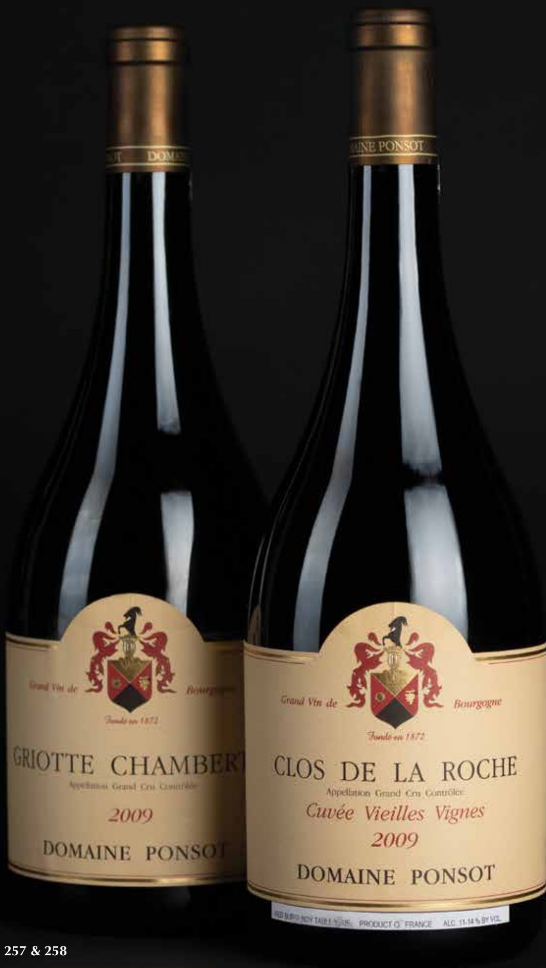
Lots 255, 257 & 258