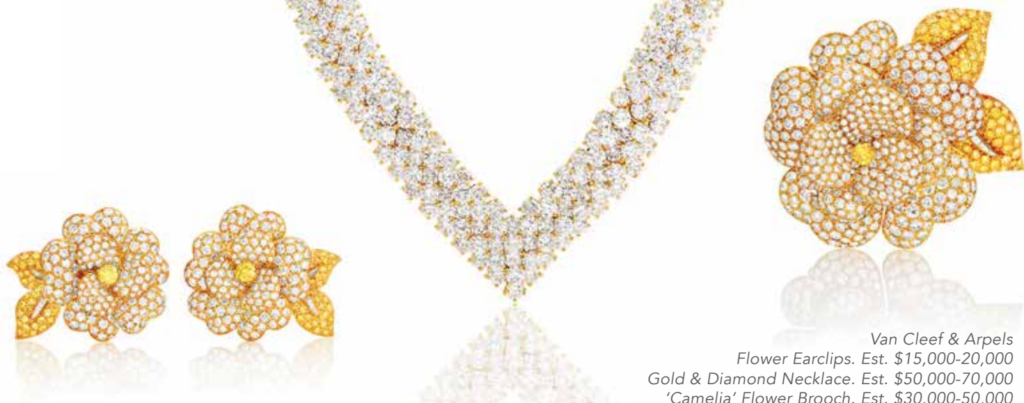
Van Cleef & Arpels Flower Earclips. Est. $15,000-20,000 Gold & Diamond Necklace. Est. $50,000-70,000 'Camelia' Flower Brooch. Est. $30,000-50,000