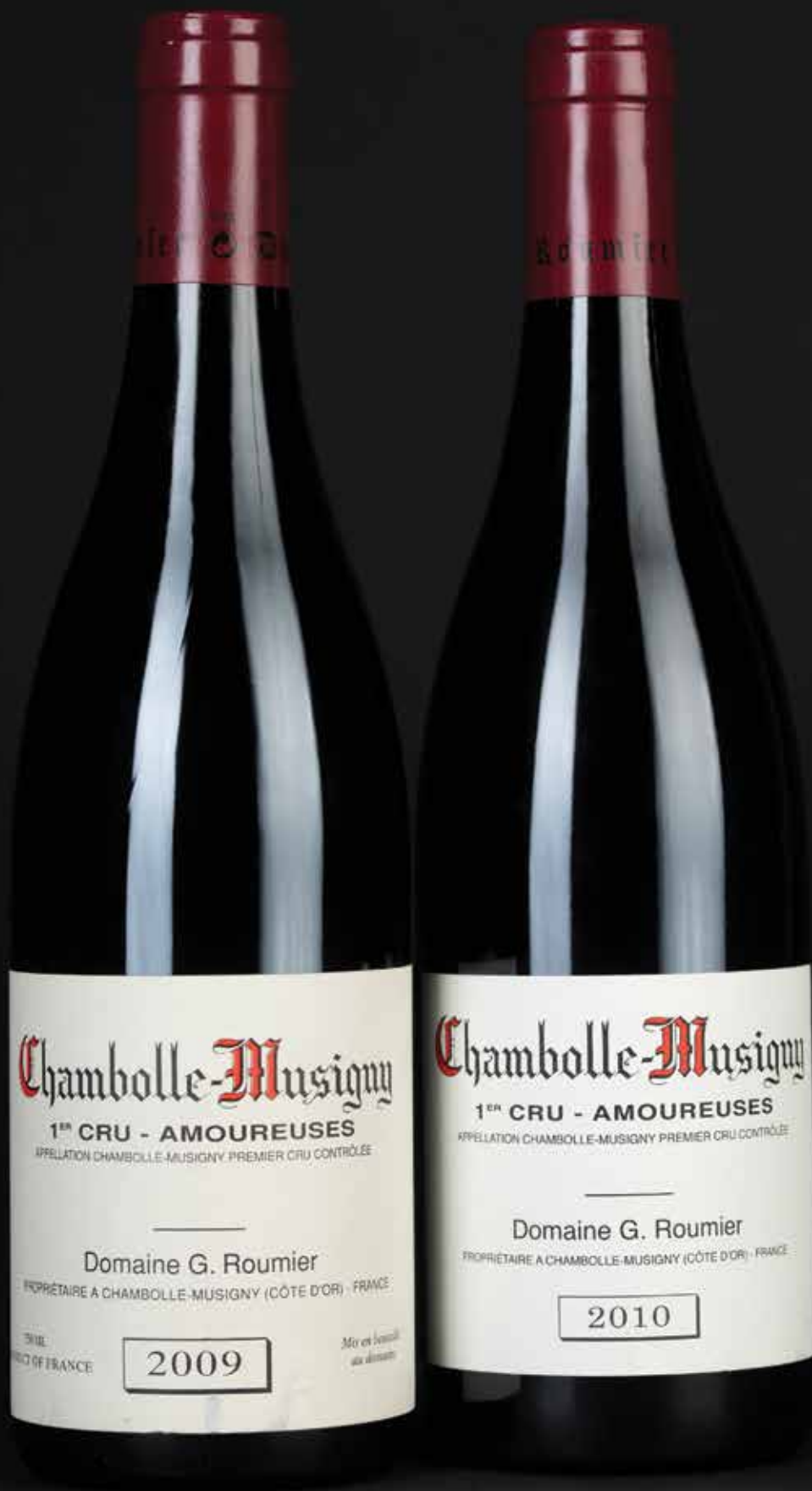
Lots 123 & 124