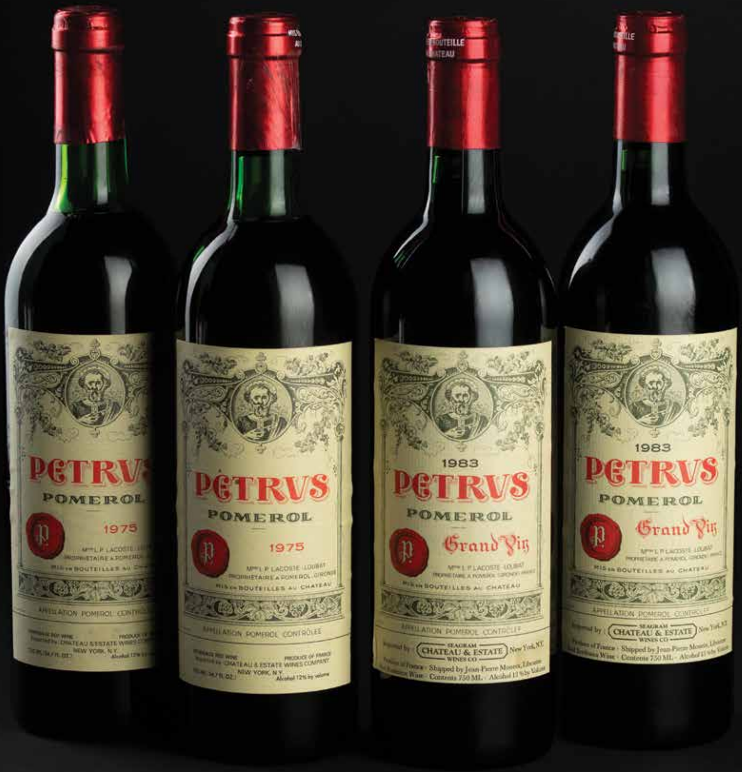
Lots 691 & 693