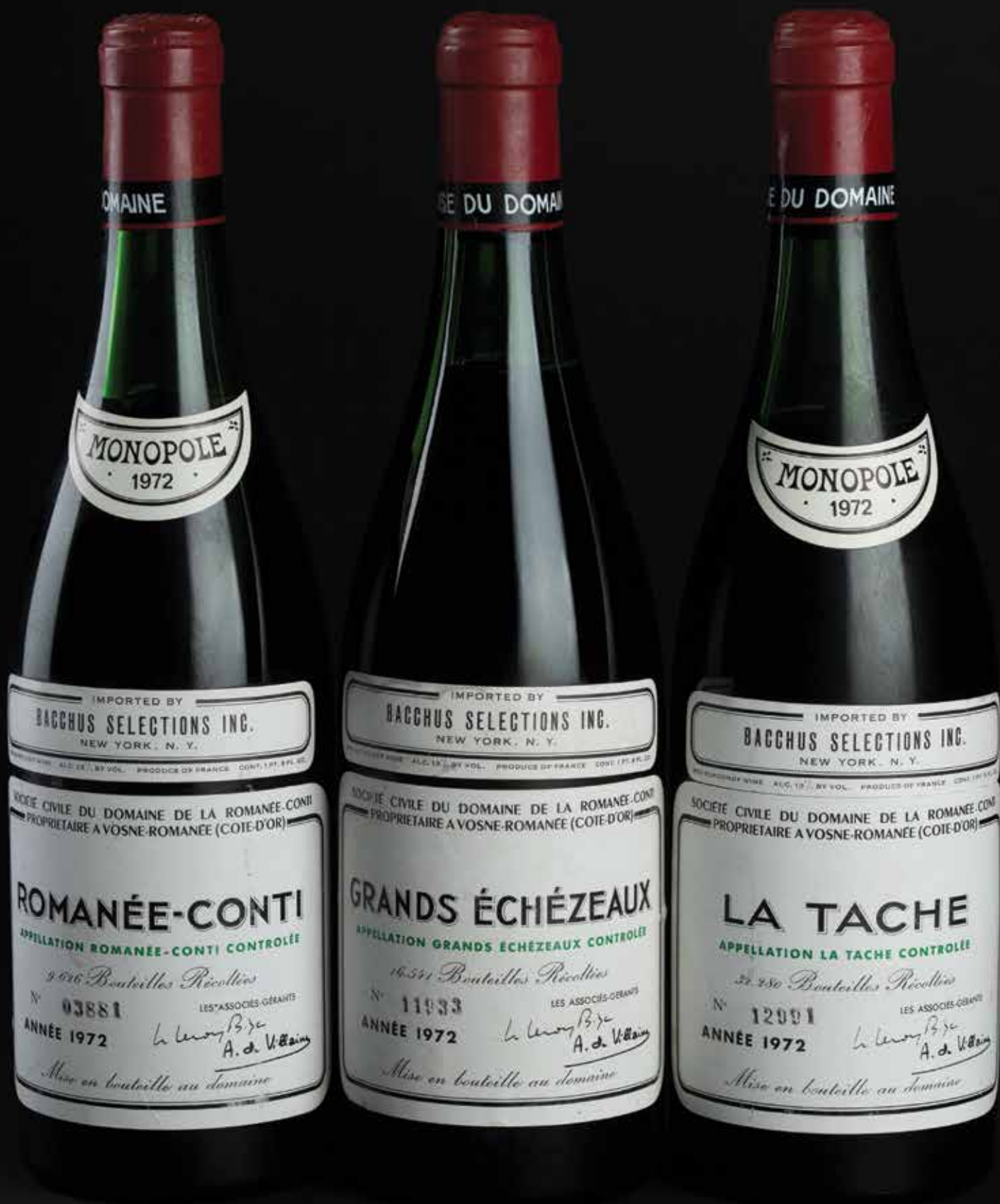
Lots 704, 705 & 707