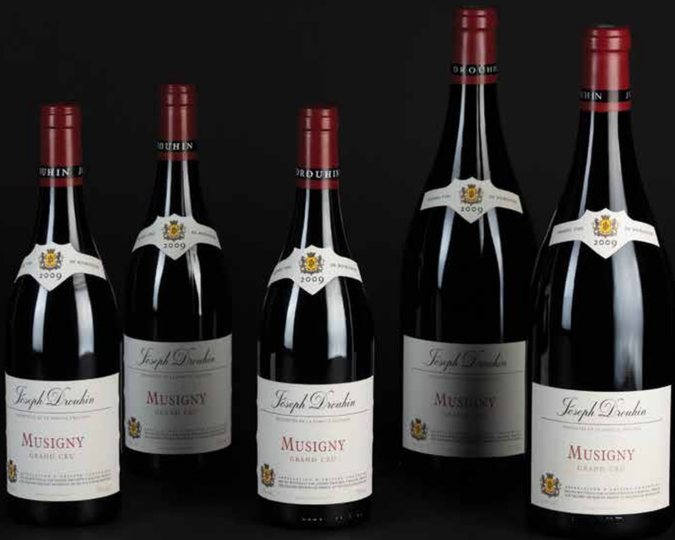
Lots 225 & 226