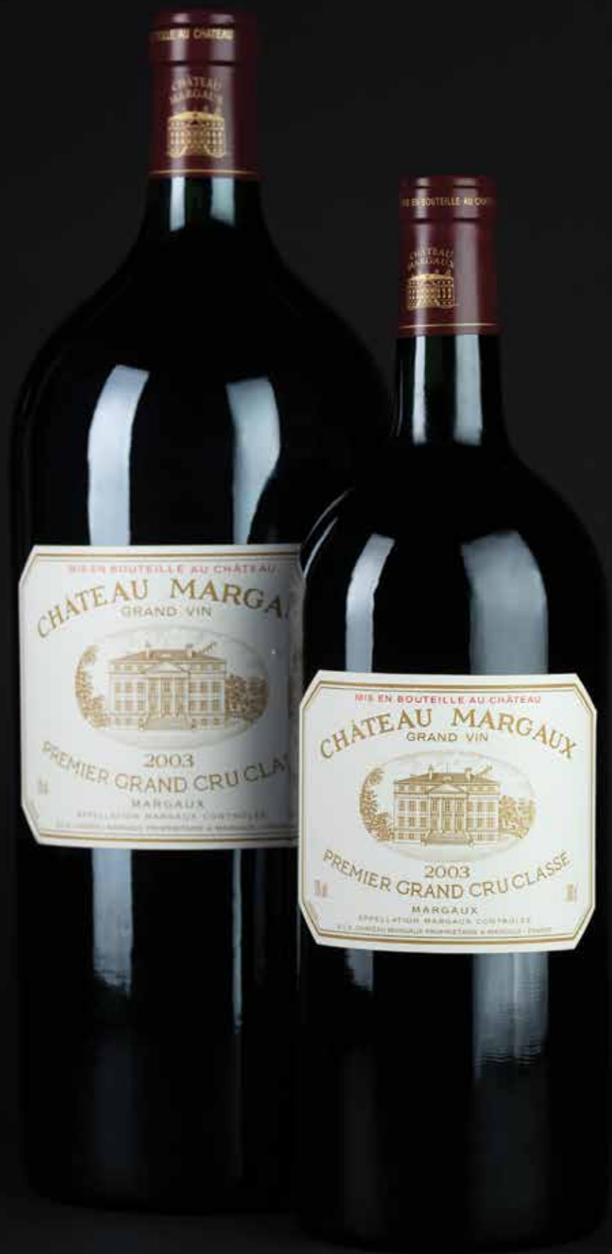
Lots 3 & 4