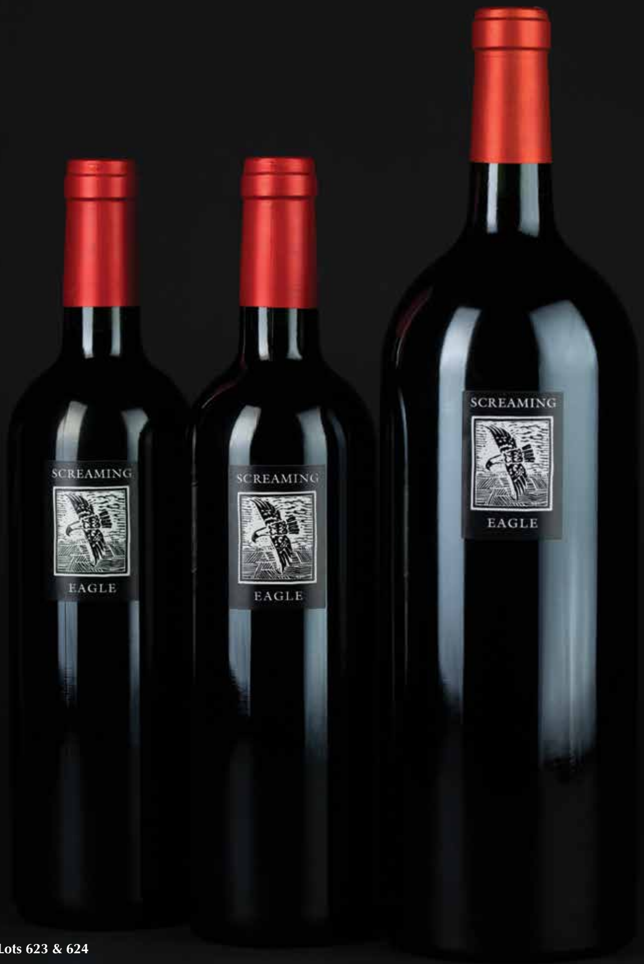
Lots 623 & 624